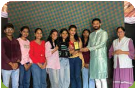
Colorful Day, symbolizing unity and youthful energy