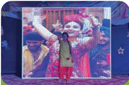
Traditional Day, celebrating India’s cultural heritage

“VAJRA 2025” brought color, joy, and cultural vibrancy to the campus. The three-day event featured: