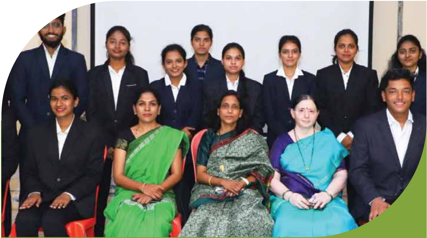
Yadavrao Tasgaonkar Institute Of Pharmacy

Yadavrao Tasgaonkar Institute of Engineering and Technology continues to stand as a beacon of quality education, innovation, and holistic development. With a strong foundation of academic excellence, skilled faculty, and industry-focused learning, the institute consistently shapes future-ready engineers. Beyond classrooms, students are encouraged to lead, innovate,