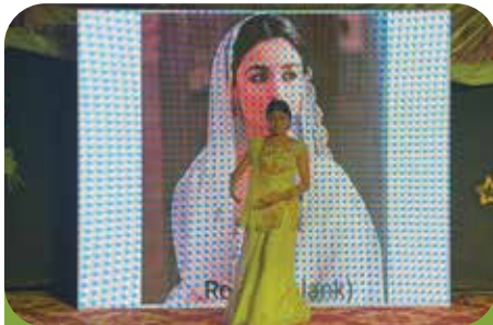
Bollywood Day, filled with fun, entertainment, and creative outfits